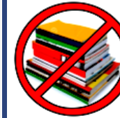
Books & Magazines